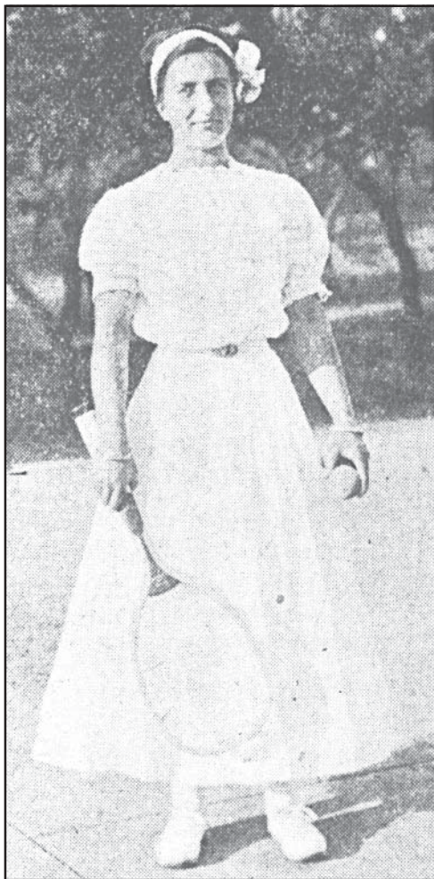
Hazel Hotchkiss Wightman