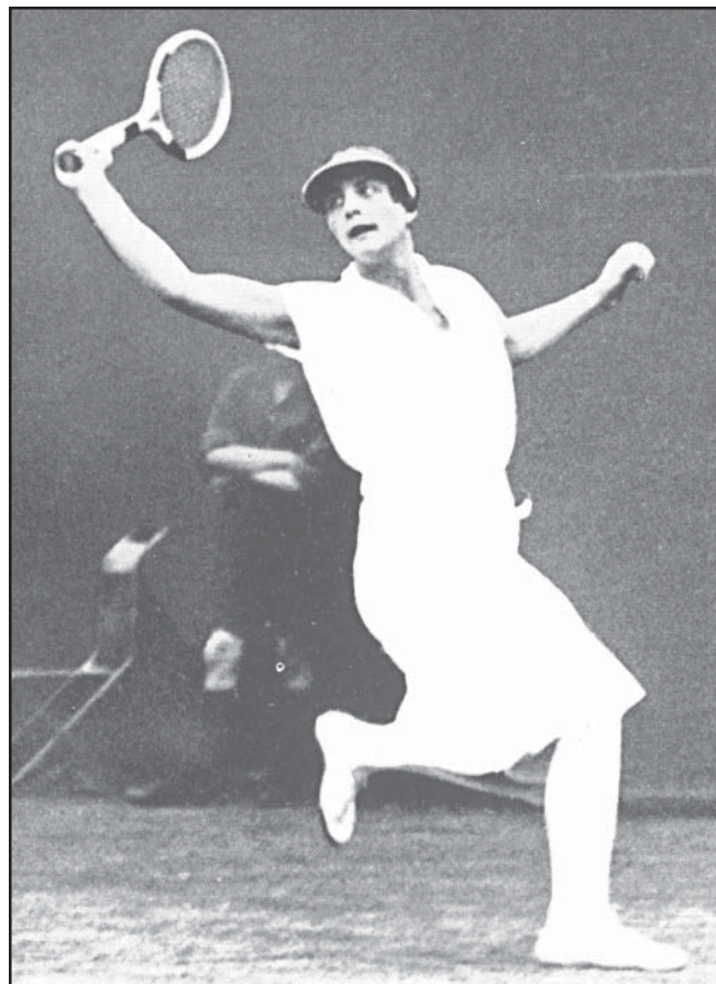
Helen Wills Moody Roark

Jacobs, too, achieved international success, winning a Wimbledon singles championship in addition to singles and doubles titles at the Italian Open. Jacobs spent a total of 13 years in the USTA's First 10 and capped off her career as the top ranked U.S. woman from 1932-35.